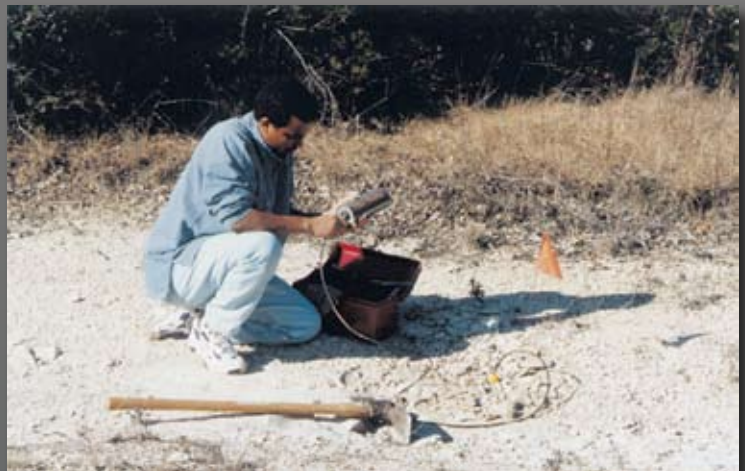
Demonstrating the installation of a 125A station.