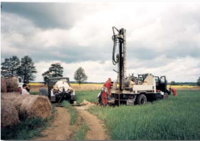
Drilling shot holes during Polonaise experiment, May 1997.

The self-contained Texan features a low-noise differential input amplifier, 24-bit analog-to-digital converter (ADC), solid-state data storage, and batteries, all in a sealed aluminum case. Up to 15 Texans are stored, setup, and transported. For setup, the Texans are connected to a hub that provides power, connection to the host computer via Hi-Speed USB2.0, and timekeeping signals from a GPS receiver.