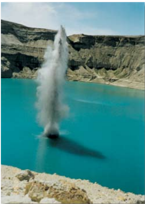
Water geyser from under water explosion during CTBT tests in Wyoming, summer 1997.

For crustal scale reflection experiments, instruments are deployed for three to five days with six to eight hour continuous recordings using a vibrator energy source. After each day's recording, data is downloaded, and the Texan is initialized for the next day's recording. Because the data may be stacked, time accuracy must be within \pm 2 msec. Time accuracy must be within \pm 2 msec since the data may be stacked.