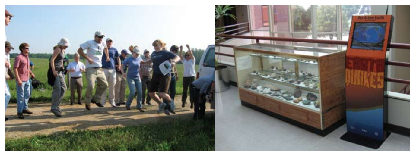
Figure A5.5. Participants in siting workshop jump to demonstrate the sensitivity of the nearby seismometer