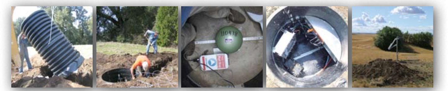
Figure A5.2. Installation of a Transportable Array station (left panels), instrumentation (middle and middle right panels), and completed station (right panel). The vault is under the mound of dirt in the foreground.

Each TA station is equipped with a three-component broadband seismometer (Figure A5.2). All data from the TA are collected in real time, and are subjected to a variety of automated and manual quality-control reviews. The data quality from TA stations has been extremely high, with lownoise performance that is very consistent across the array. The TA stations generate long, continuous (gap-free) time series with very high data availability. In 2009, the average data availability across the whole TA was 99.3%.