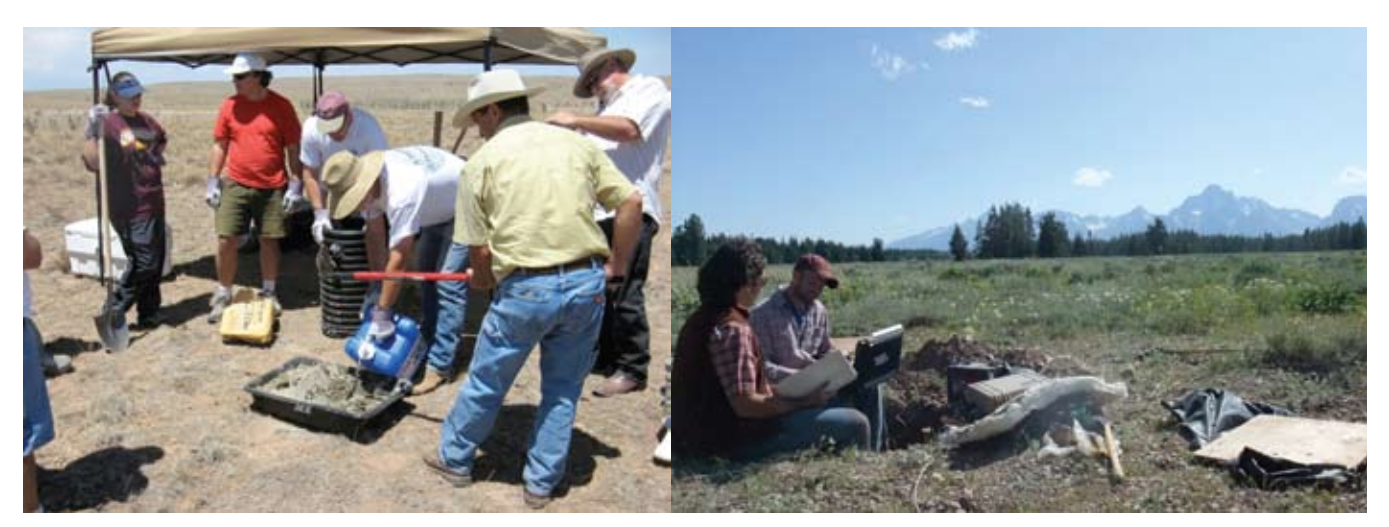
Figure A5.3. Training the deployment team at the beginning of an FA experiment.

USArray data are archived and distributed via the IRIS Data Management Center. Over 27 terabytes of EarthScope seismic data have been archived to date, and these data are distributed at rates exceeding 8 terabytes per year. All USArray data are made available through the request tools supported by the DMC, and the TA data are also served through the real-time data streaming protocols supported by the DMC. USArray data usage has been very high, with more than twice