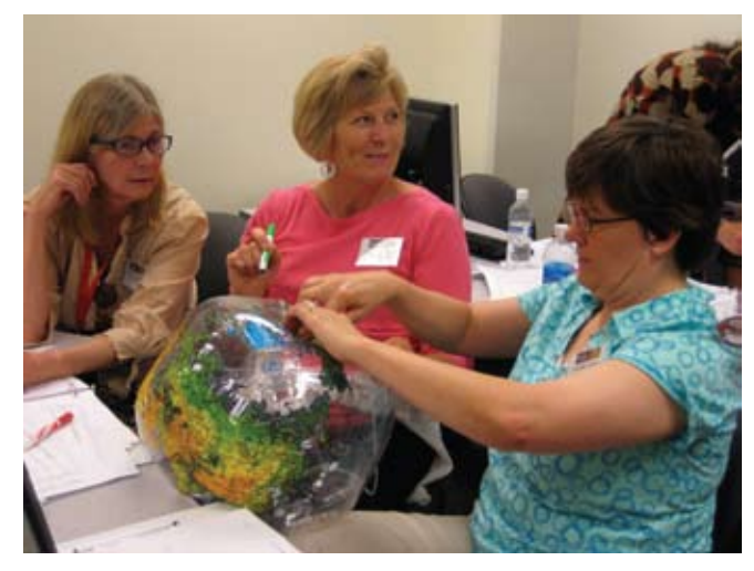
Figure A5.7. Teachers locate an earthquake during an EarthScope Workshop

The Siting Outreach component of USArray is implemented in collaboration with IRIS E&O to facilitate siting of USArray stations and works with numerous state and local organizations to encourage the use and understanding of USArray. University PIs and students are recruited every summer to do the initial reconnaissance for TA stations sites. Over the last several summers, more than 100 students from 38 different universities have done site reconnaissance on 970 different TA stations sites. To further broaden the reach of USArray, the SO team works with the PIs and their respective Communications Office to issue press releases about their involvement in EarthScope. This activity has generated significant interest from local news media and has resulted in a growing number of print, online and broadcast stories about the project, including an article in USA Today in June 2010. The SO team also produces and distributes onSite, a publication prepared twice each year to communicate news about USArray and EarthScope to more than 1100 current and former hosts of Transportable Array stations. Additionally, SO has helped organize science cafes and workshops (Figure A5.5), developed content for the Active Earth Display interactive kiosk (Figure A5.6), loaned Active Earth Display kiosks to sites in the USArray TA footprint, and distributed AS-1 seismometers to teachers and trained them in the use of these instruments (Figure A5.7).