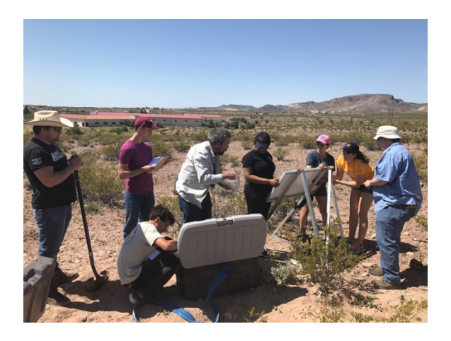
In Socorro, New Mexico, the 2017 IRIS interns install a seismometer with PASSCAL staff scientists.

As the IRIS internship program celebrates its 20th year, we look back to see how the program has grown, impacted students, and influenced our seismology community. Each year the summer program hosts ~15 students that experience a 1-week immersive orientation, 8-10 weeks of research guided by a science mentor, and a final presentation at the AGU Fall Meeting. We will present multiple years of quantitative and qualitative data highlighting pre and post internship experiences, along with information on the academic and career paths of intern alumni. This collaborative study, between IRIS EPO staff and the Geoscience Education Research (GER) community, explores the relationship among participants' paths with factors such as self-efficacy, intern group dynamic, and sense of belonging within the geosciences. Additionally, based on IRIS Internship Program success, we will discuss how the seismology community can apply program components at their own institutions and furthermore, participate in GER to strengthen both communities.